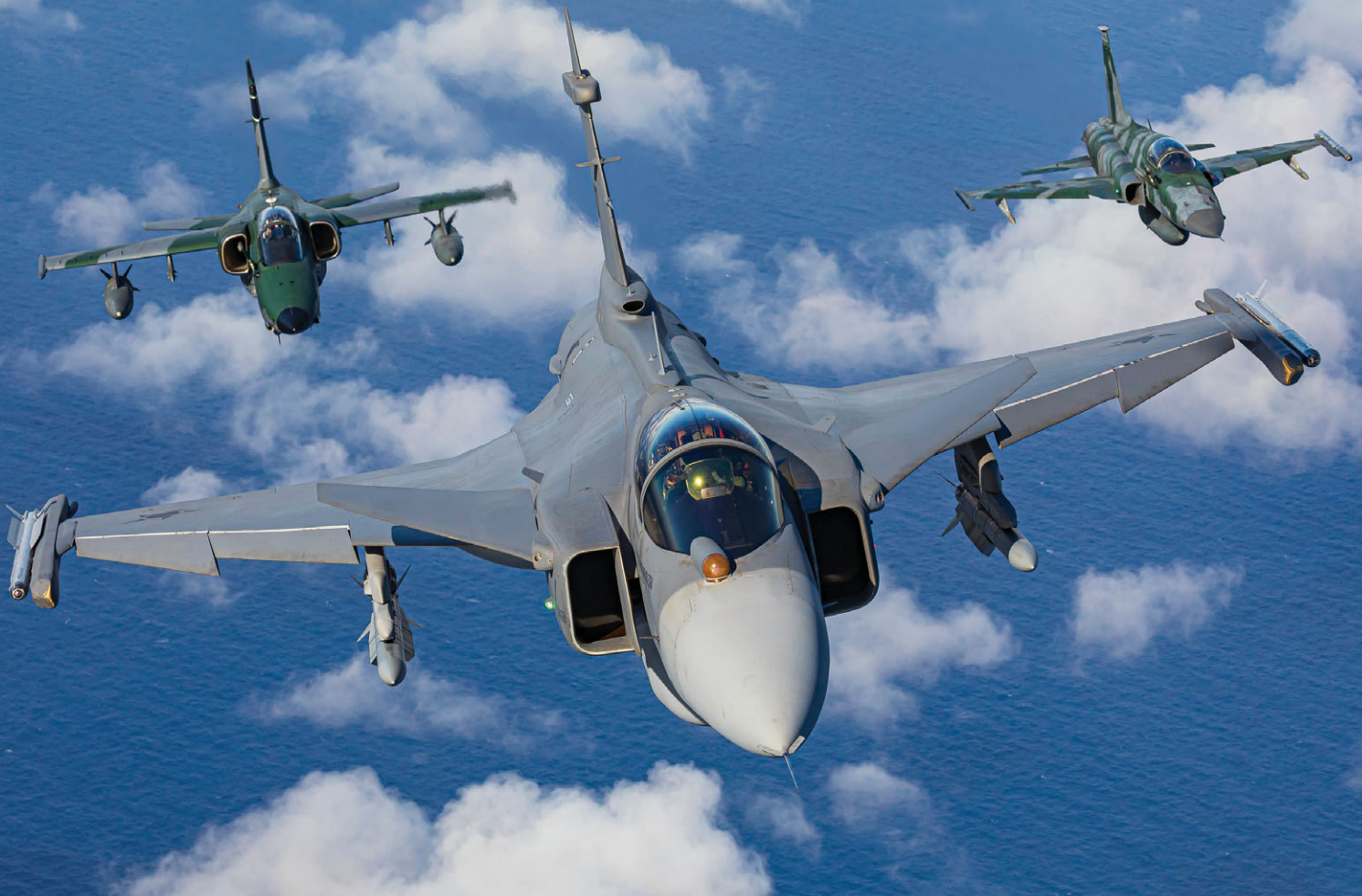
Brazilian air force

The information contained in this report was prepared using Cirium fleets data, and whilst reasonable care has been taken to ensure accuracy, the information is supplied on the understanding that no legal liability whatsoever shall attach to FlightGlobal, its offices, or employees in respect of any error or omission that may have occurred.