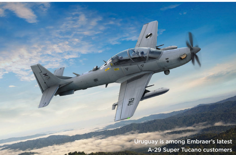
Uruguay is among Embraer's latest A-29 Super Tucano customers