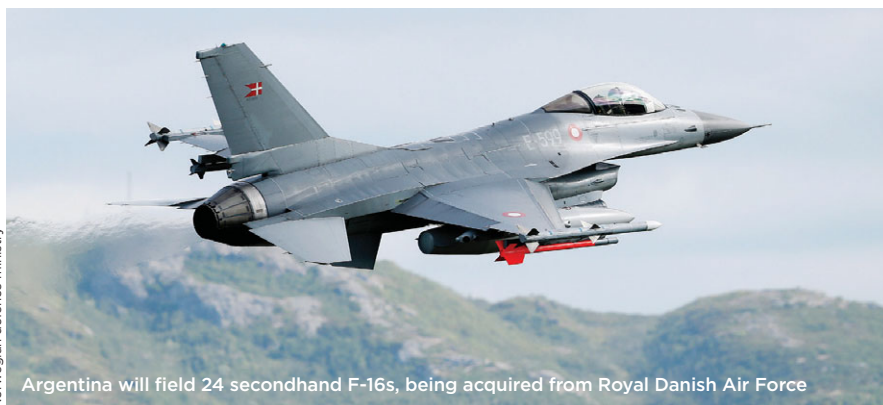
Norwegian defence ministry