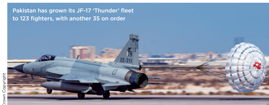
Pakistan has grown its JF-17 'Thunder' fleet to 123 fighters, with another 35 on order