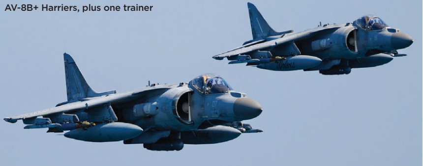
The Italian navy employs a dozen AV-8B+ Harriers, plus one trainer