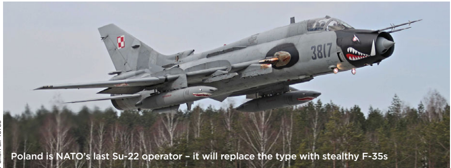
Polish air force

Poland is NATO's last Su-22 operator - it will replace the type with stealthy F-35s