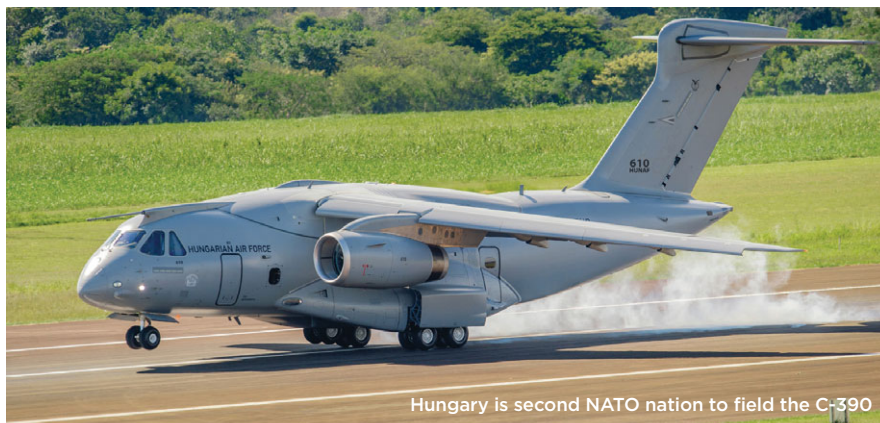
Hungary is second NATO nation to field the C-390