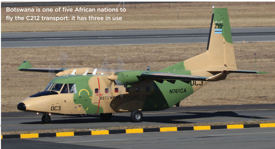
Botswana is one of five African nations to fly the C212 transport: it has three in use