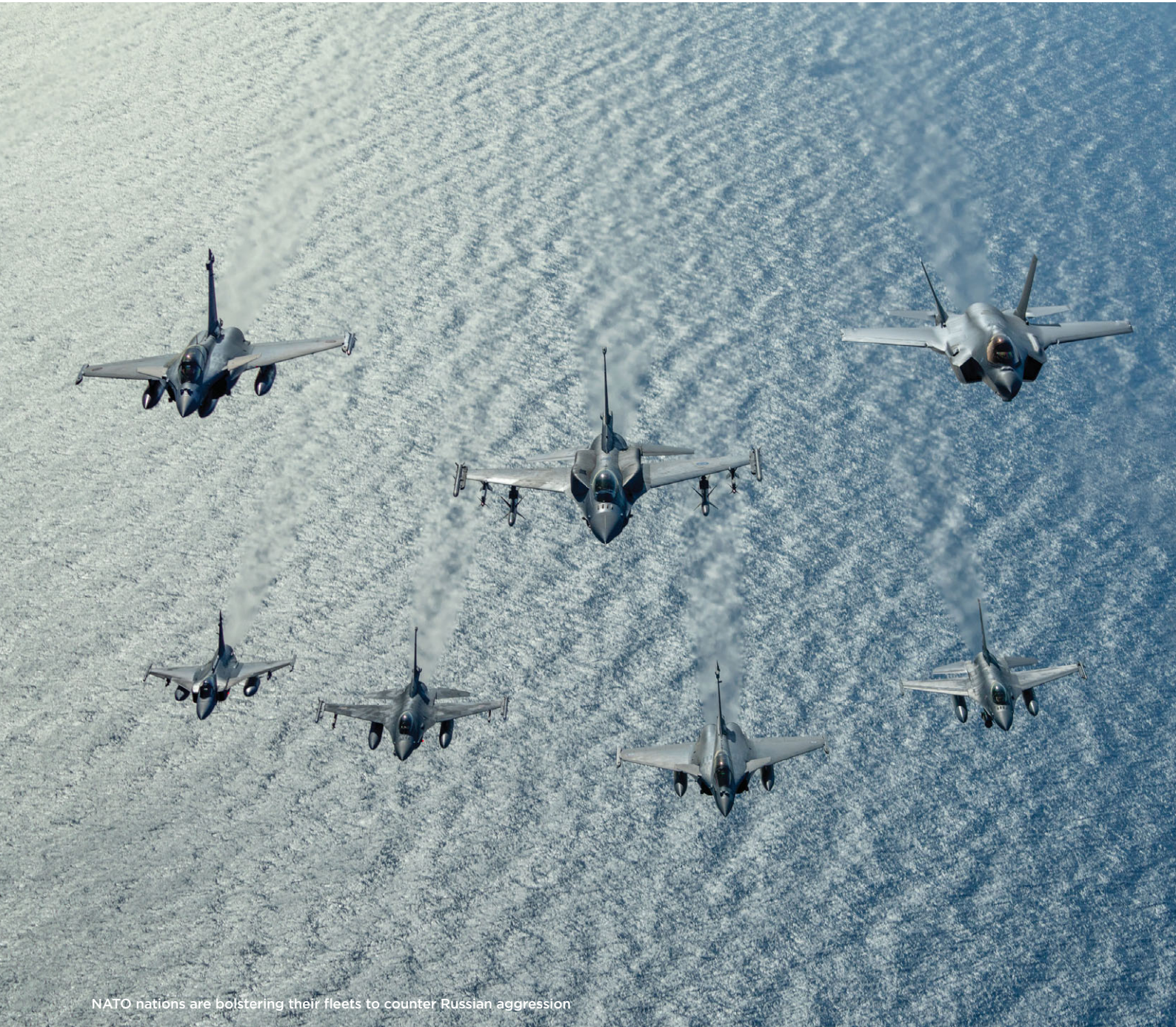
NATO nations are bolstering their fleets to counter Russian aggression