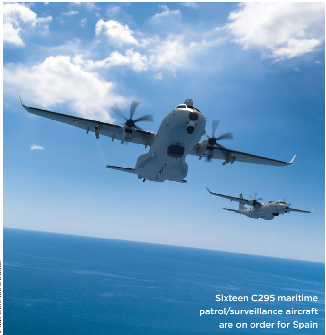
Sixteen C295 maritime patrol/surveillance aircraft are on order for Spain

Also excluded are more than 730 aircraft permanently assigned to performing VIP,