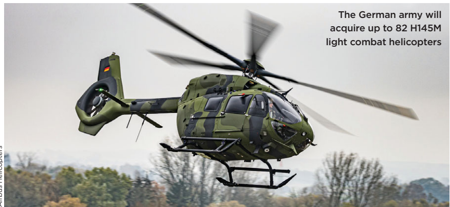
The German army will acquire up to 82 H145M light combat helicopters