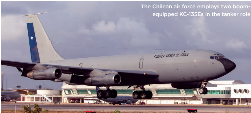
The Chilean air force employs two boom-equipped KC-135Es in the tanker role