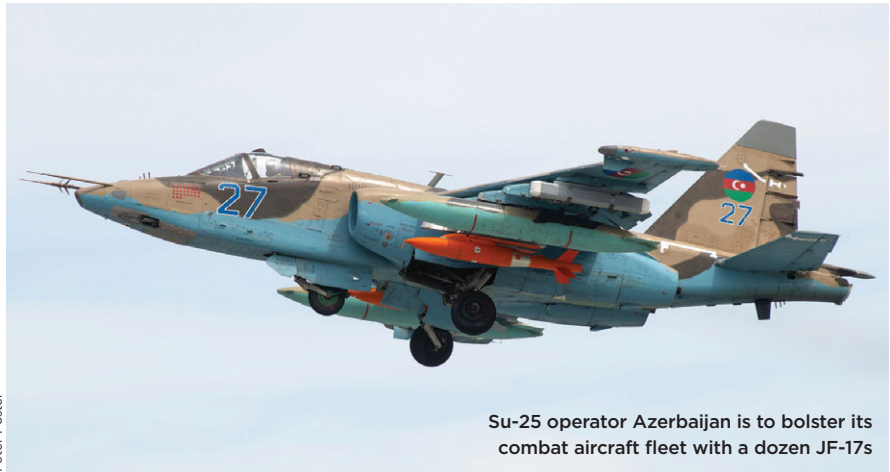
Su-25 operator Azerbaijan is to bolster its combat aircraft fleet with a dozen JF-17s