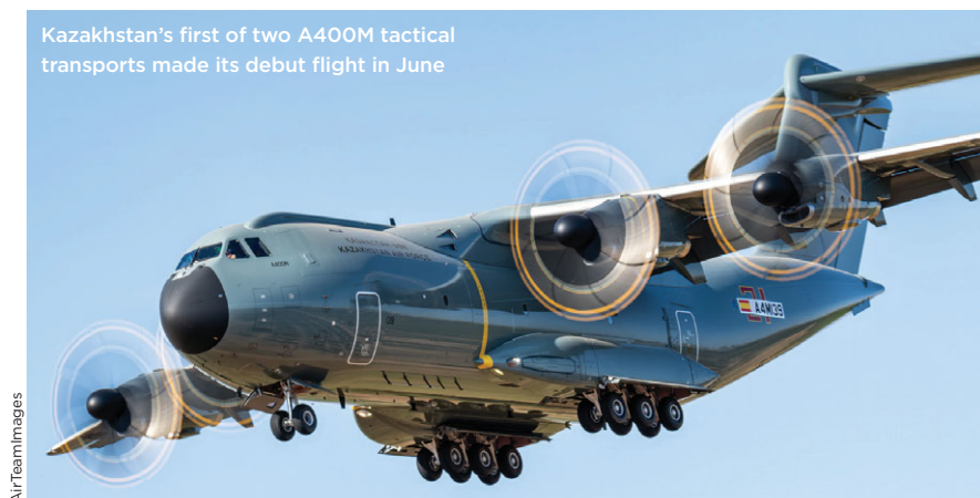
Kazakhstan's first of two A400M tactical transports made its debut flight in June