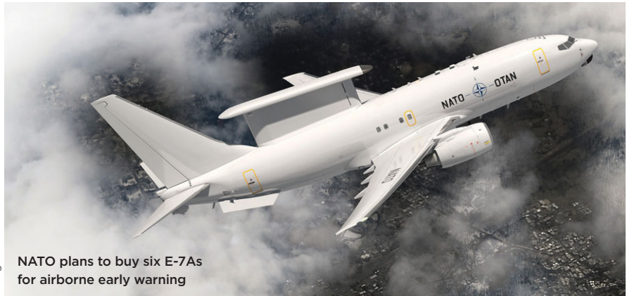
NATO plans to buy six E-7As for airborne early warning