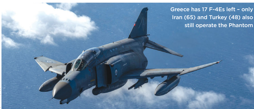
Greece has 17 F-4Es left – only Iran (65) and Turkey (48) also still operate the Phantom